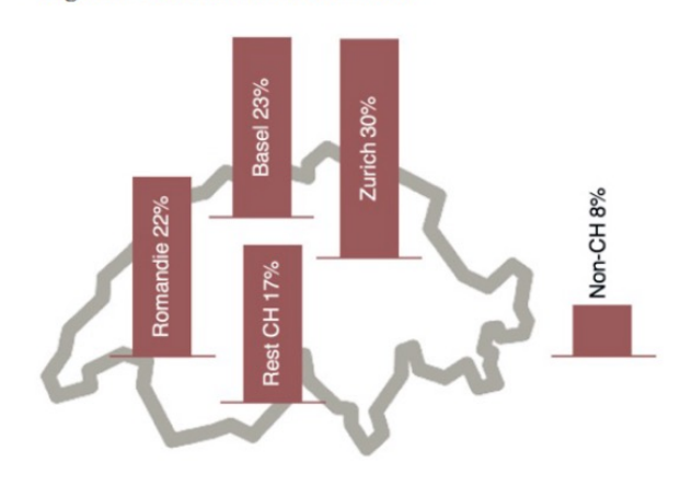
Regional Distribution of Members*