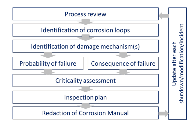
Risk Based Inspection methodology